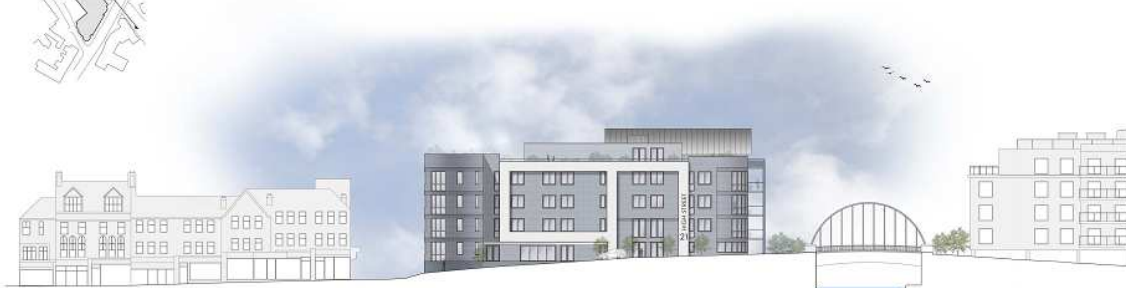
High Street Elevation